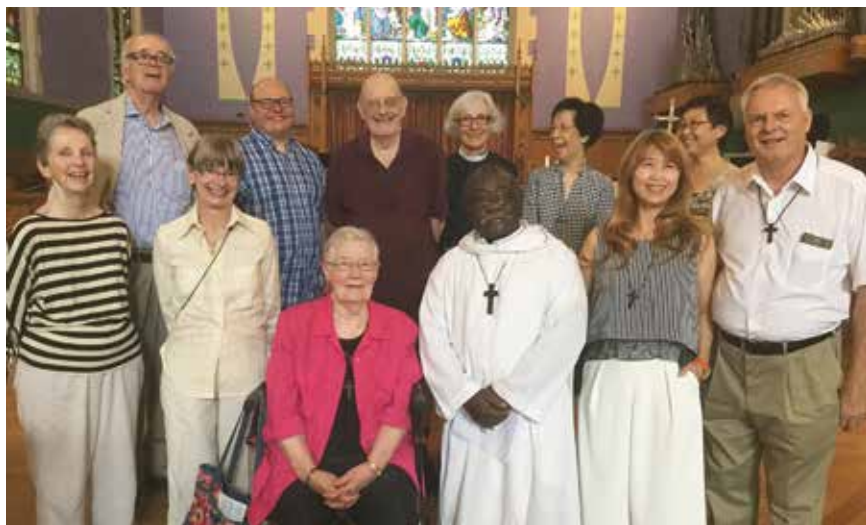
ASSOCIATES GATHERED FOR HOLY CROSS DAY 2017.